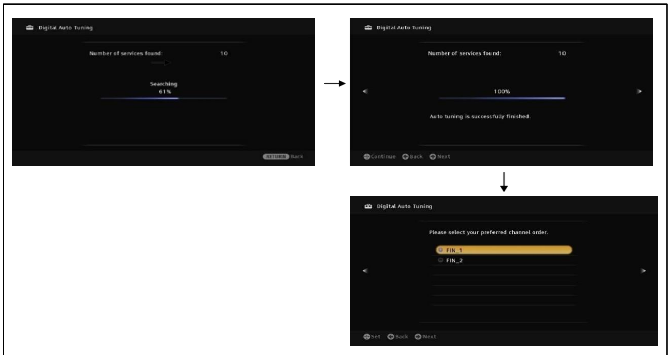
Figure 6. User experience during channel list selection

In this example, a news channel has 3 regional variations, central, northern and southern. The service for the user’s own region should be placed at LCN 1 while the services for the other regions if the receiver is able to receive them shall be placed at LCN 100 onwards.